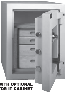
CE2518 WITH OPTIONAL STOR-IT CABINET

OPTIONAL STOR-IT CABINETS AVAILABLE IN CE AND CF MODELS: 2518 / 3524 / 5524 / 6528 / 7236