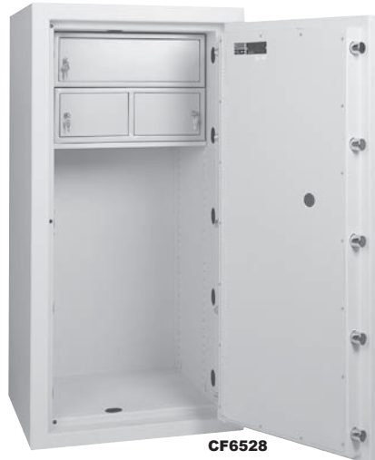
CF6528 SHOWN WITH OPTIONAL INTERIOR LOCKERS

Besides withstanding the most concentrated attacks by sophisticated burglars, each AMVAULT safe offers a Two Hour, 350° F factory fire test certification, ensuring the protection of the vault's contents against intense fires.