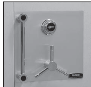
STANDARD AMVAULT ESCUTCHEON PLATE Tri-spoke handle and pull handle standard on all models.

AMVAULT High Security Composite safes have passed Underwriter's Laboratories most recent testing procedures ensuring you today's best protection. AMVAULT TL-15 and TL-30 U.L. listed composite safes qualify for Mercantile & Broadform Insurance Class ER (TL-15) and F (TL-30) with a Bank Rating of BR (TL-15) and G (TL-30). Two Hour Class 350°F manufacturers' fire label. Standard finish is Parchment. Other colors available on request.